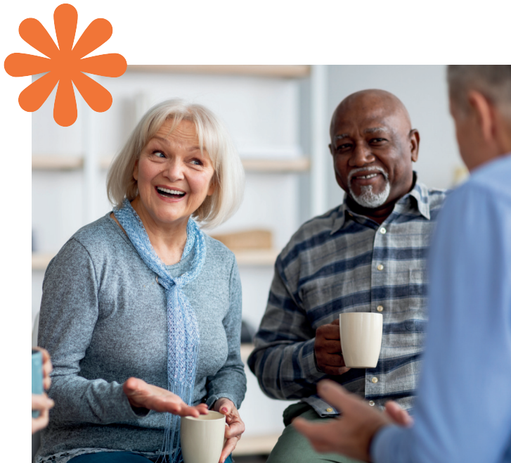
A great event to meet and connect with your community.

Friday, May 22nd | 'Lawn Bowling in Cobourg' Experience the history and social benefits of one of Cobourg's oldest pastimes. The local club will discuss the its activities, the sport of lawn bowling, and how you can join this active community on the greens.