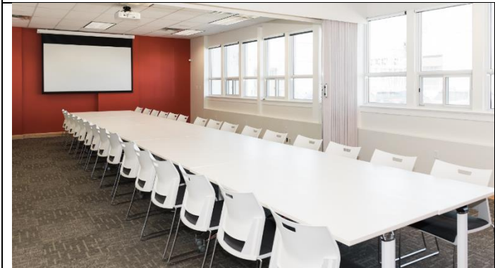
Innovation Commons – Seminar Rooms