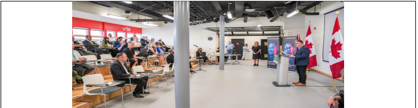
Innovation Commons – Lecture Hall