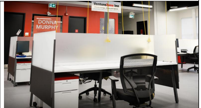
The VentureZone Co-Working Space