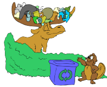
Harmony & Conflict Human/Wildlife

The presence of wildlife in urban settings is normal, inevitable and in itself should not be cause for public concern.