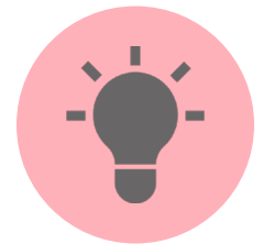
Parks and Recreation