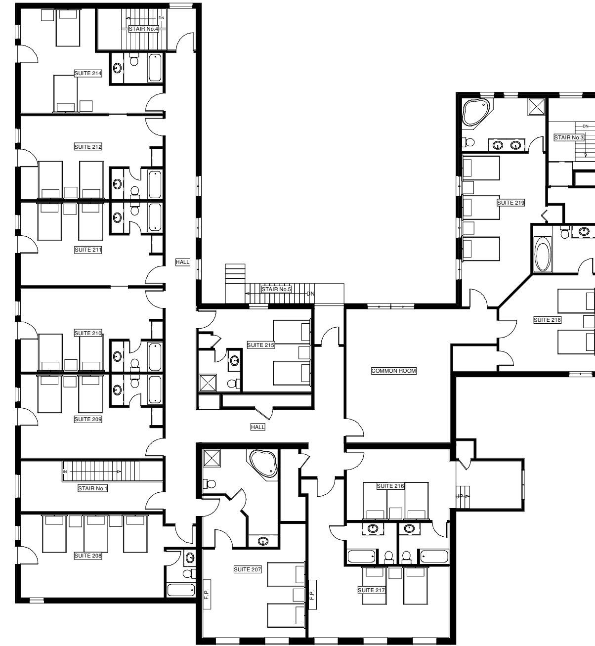
26 'Double' Size Beds this floor