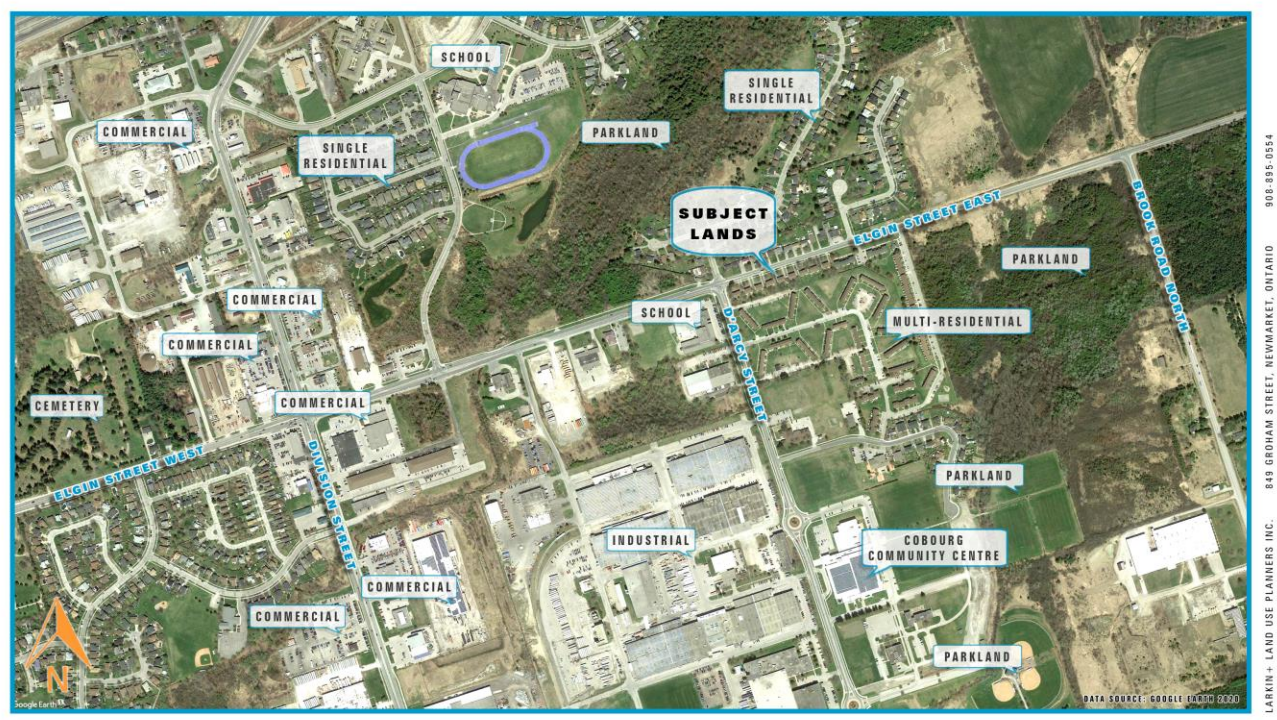
FIGURE 3 AERIAL OF SURROUNDING LAND USES 265-327 ELEIN STREET EAST, COBOURG, ONTARIO

The area also is well serviced by public schools to the south and the west, a day care to the south, employment uses to the west and open space uses to the east, providing an opportunity to live, work and play within the general area.