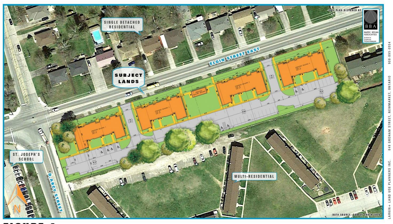
FIGURE 4 SITE PLAN OF PROPOSAL 265-327 ELGIN STREET EAST, COBOURG, ONTARIO

The application for a Zoning By-law Amendment will enable the creation of 40 residential units within 4 2-storey buildings with basements all fronting onto Elgin Street East (see Figure 4: Conceptual Site Plan of Proposal). The buildings will front along and have entrances from Elgin Street East but driveway access will be provided via a parking lot that is located to the rear of the property and runs parallel to the proposed buildings.