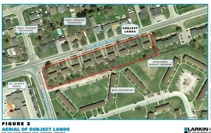
AERIAL OF SUBJECT LANDS 265-327 ELGIN STREET EAST, COBOURG, ONTARIO

207.3 m along Elgin Street East. The property currently is occupied by a total of 18 older semi-detached units. Trees and vegetation exist along Elgin Street at the front of the existing units and along the rear in the backyards.