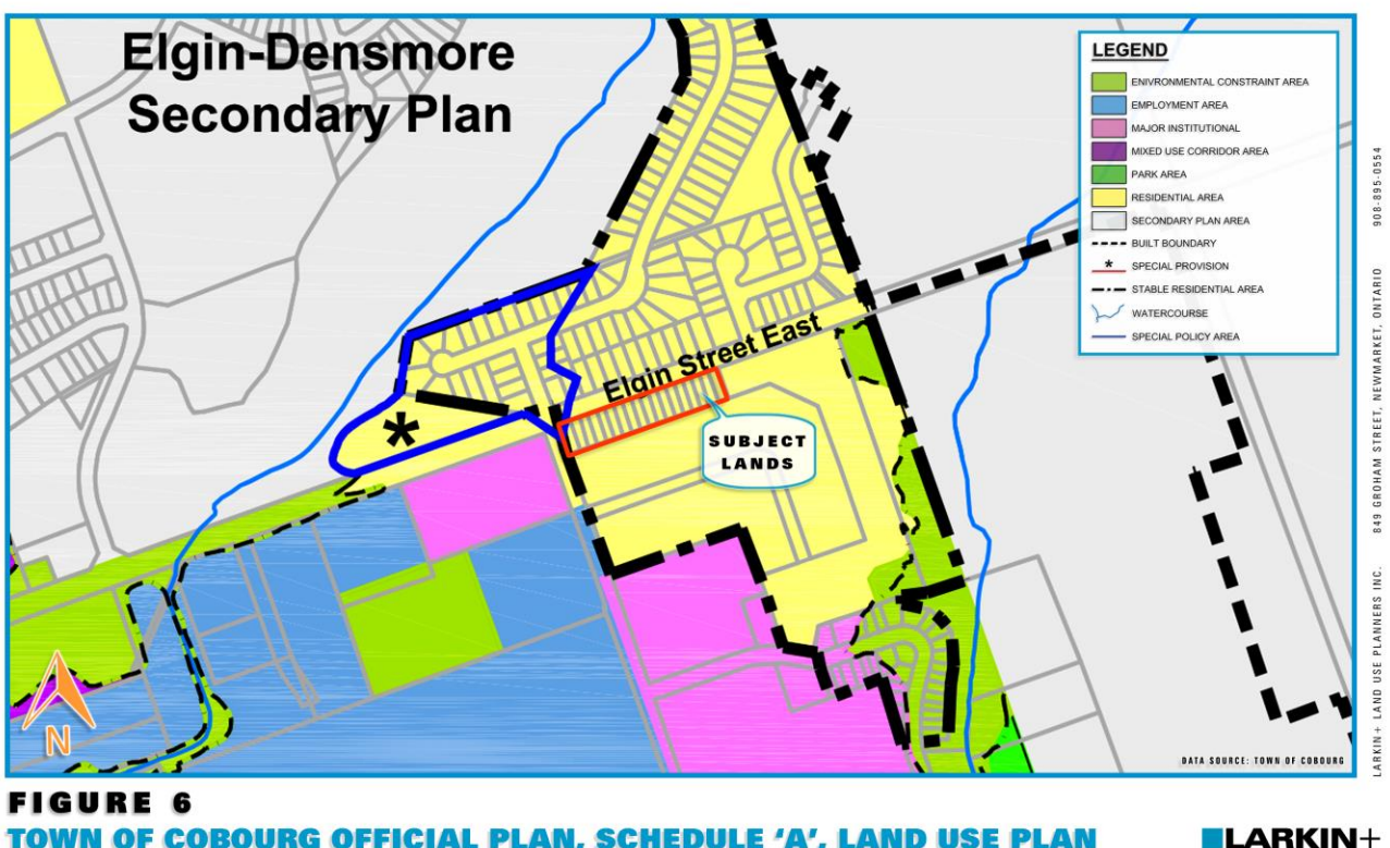
TOWN OF COBOURG OFFICIAL PLAN, SCHEDULE 'A', LAND USE PLAN 265-327 Elgin Street East, Cobourg, Ontario

The Subject Lands are designated as "Residential Area" on Schedule 'A' Land Use Plan in the Town of Cobourg Official Plan (TCOP) (see Figure 6: Town of Cobourg Official Plan Schedule 'A' Land Use Plan).