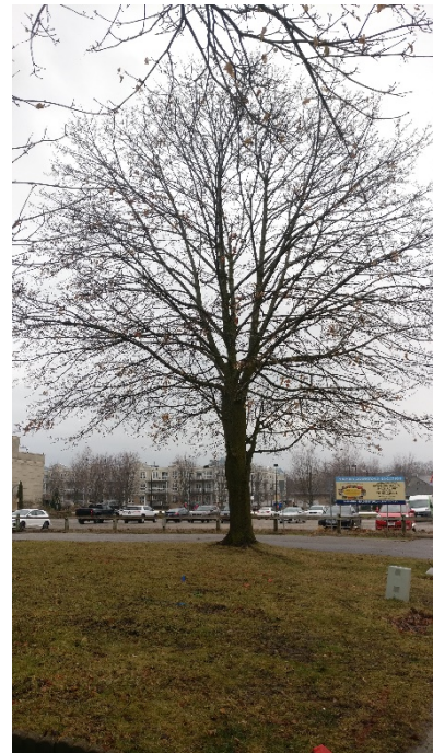
Tree 1 Canopy