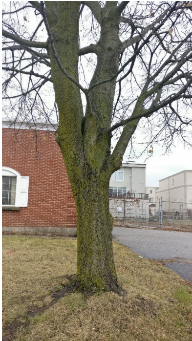
Tree 1 Trunk