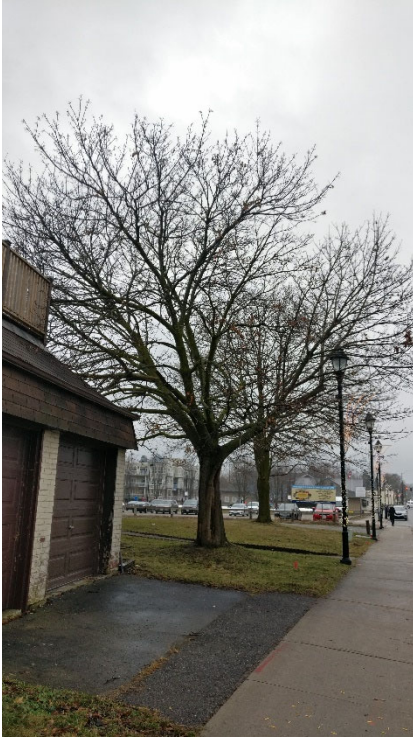
Trees 1 and 2