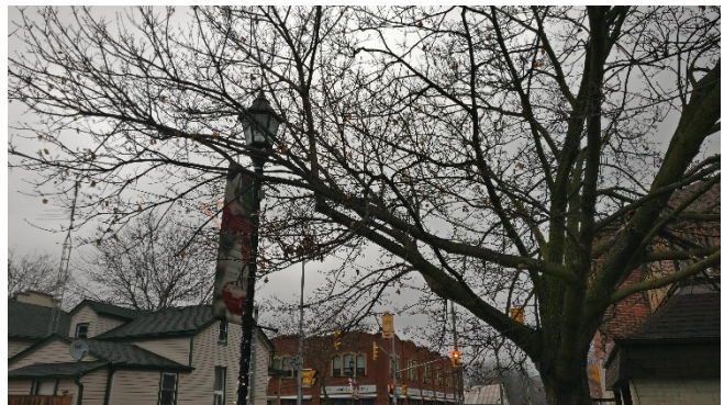
Tree 2 Crown