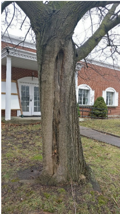
Tree 2 Trunk