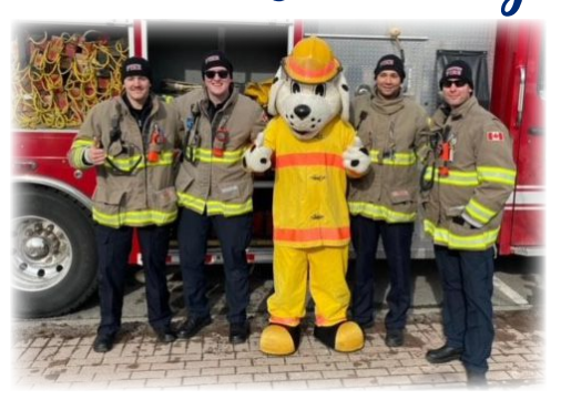
The Cobourg Fire Department attends numerous community events each year to provide public education, including a door-to-door smoke alarm program.