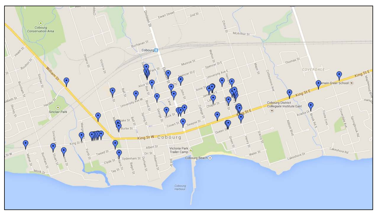
Figure 3: Map showing properties designated under Part IV of the Ontario Heritage Act (<u>source</u>: Town of Cobourg).

The Municipal Heritage Register of non-designated properties of cultural heritage value or interest contains 218 properties dating from the early 1800s to the early 1900s, though several properties do not have identified dates of construction. For many properties, the Register contains a brief description of the resource, such as its building type, size or architectural style. The properties are generally located north and south of King Street (as well as some on King Street itself), between Burnham Street and Brook Road North.