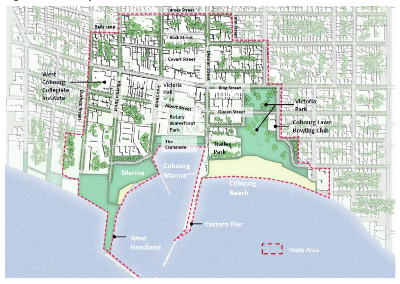
Figure 1 Study Area